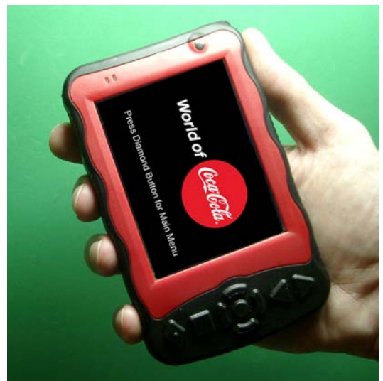
Figure 2: ATV DURATEQ in-use at the World of Coca-Cola Museum