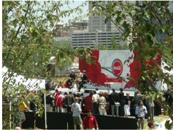
Figure 1: Outside Shot of Grand Opening of The World of Coca-Cola in Atlanta, GA

Assistive technology has truly come to life at the World of Coca-Cola today. Continue reading to see how Softeq and Durateq can make it come to life at YOUR venue.