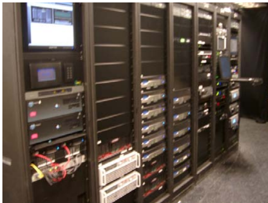
Figure 6: Show Controller

Assistive listening is also supported and can be provided for the shows. The show is received over DURATEQ ATV’s built-in FM tuner. To make this happen, the actual audio of the show is broadcast over FM and then amplified by the device through headphones for guests that need assistive listening. In this case the device actually acts like a little