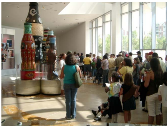
Figure 3: Guests inside the World of Coca-Cola

In most cases, the museum will first provide a blueprint of the floor plan and all the exhibits throughout the venue. At the World of Coca-Cola, exhibits are categorized into two different styles of attractions: “walk-through” exhibits (Coca-Cola artifacts, bottling line, etc.), and “sit-down” theater shows. These two types of attractions require similar equipment but different installation steps.