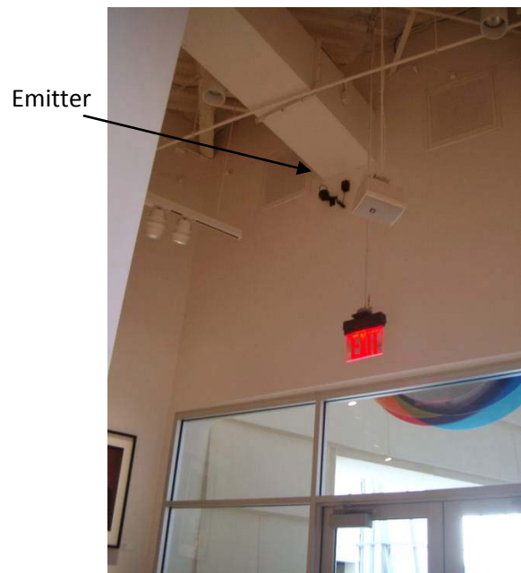
Figure 5: Emitter strategically placed