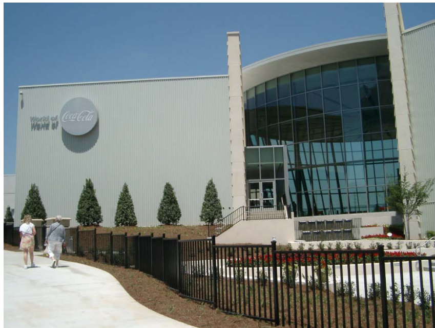
Figure 9: The World of Coca-Cola Museum in Atlanta, GA

The World of Coca-Cola®, in the heart of downtown Atlanta, is the only place where visitors can explore the complete story -- past, present and future -- behind the world's best-known brand. For more information, visit www.worldofcoca-cola.com .