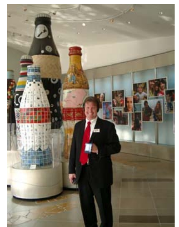
Figure 8: Coke rep with DURATEQ ATV device and headphones

All DURATEQ ATV devices are stored at the guest services counter in their multi-charging docs. Softeq provides a brief training session for the staff to ensure successful adoption of the assistive technology solution.