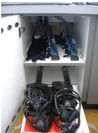
Figure 7: DURATEQ ATV Devices and Headphones at Guest services ready for action.

All DURATEQ ATV devices are stored at the guest services counter in their multi-charging docs. Softeq provides a brief training session for the staff to ensure successful adoption of the assistive technology solution.